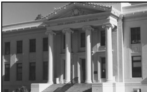
Inyo County Courthouse, Independence

Inyo County is a land of contrasts formed by the diverse and abundant natural riches located here. The County includes the lowest elevation in the Western Hemisphere (-282 feet in Death Valley), the highest point in the continental United States (14,497 feet at Mount Whitney), and one of the deepest valleys in the world (Owens Valley). Within and between each of these areas is an extremely diverse palette of communities, landscapes, and natural habitats that make Inyo County a distinct place to live and visit.