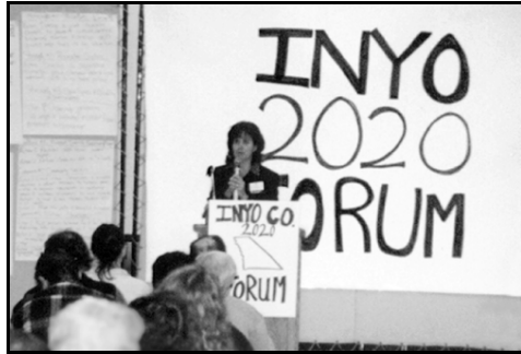
The Inyo County 2020 Forum brought together people from around the County to discuss issues and opportunities.