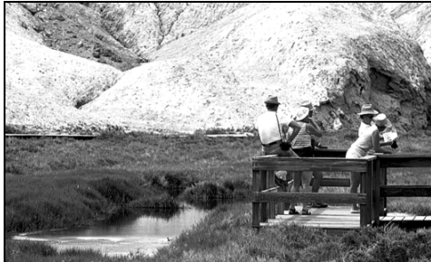
Salt Creek in Death Valley