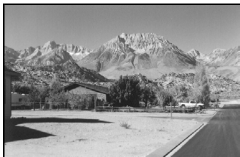
The General Plan and Zoning Ordinance update will be used to replace the Starlite Estates Specific Plan.

A general plan must be comprehensive both in geographic scope and the range of subjects covered. In the case of the Inyo County General Plan, the planning area encompasses the entire County, minus the