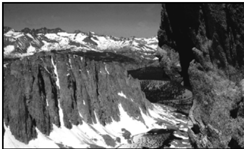
Trail Crest on the Mt. Whitney Trail